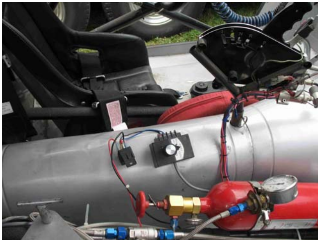
Selector Switch (3-Positions: Burnout, Race-1 & Race-2) mounted on tunnel (and relay used of “LAUNCH” signal)

Controller Box (in the 2 “empty” connectors in the photo below). It is only needed when you want to see or change any of the setting.